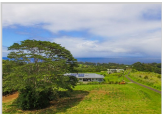
Many successful diversified farms & unique homes in area! Build your dream home in this exclusive area.