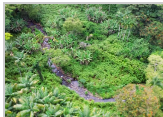
Property has trees sprawling along the downward slope on the Makea Stream frontage.