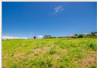
Deep silty clay loam soil is ideal for farming.

Bordering Makea Stream, you'll find this unique tropical acreage with ocean views as a great and unique opportunity to build a home in an area rich with a history of Hawaiian plantation days gone-by. Wake to breathtaking Mauna Kea Mountain views and spectacular sunrises over the Pacific Ocean! Gently sloping topography, forestry, and grasslands create a natural noise buffer. The property has trees sprawling along the downward slope on the stream frontage. In close proximity to the property are KoleKole Beach Park, Akaka Falls State Park, Umauma Botanical Gardens, and the Umauma Zipline Experience.